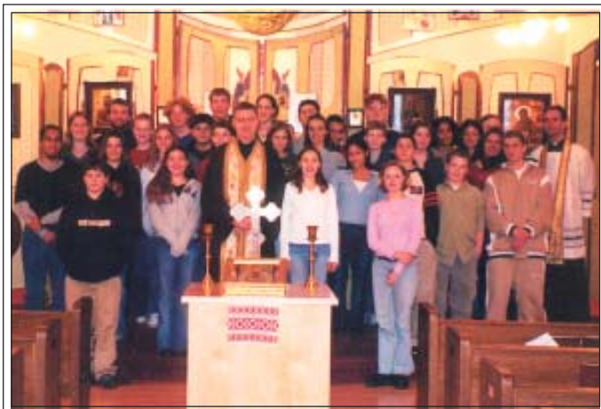
ByzanTEENS hosted in New Mexico by Our Lady of Perpetual Help parish, Albuquerque, NM.

AZ), St. Thomas the Apostle (Gilbert, AZ), St. Melany (Tucson, AZ) and St. Nicholas (Fontana, CA). A guest participant joined the group from Eparchy of Parma’s Annunciation Parish in Lockport, IL.